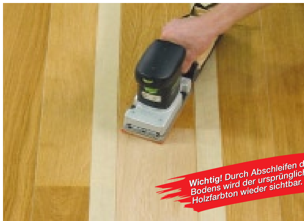
20) Even sanding of the damaged surface