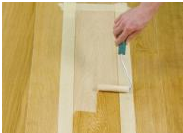
21) Thin application of Osmo Polyx®-Oil with a microfibre roller